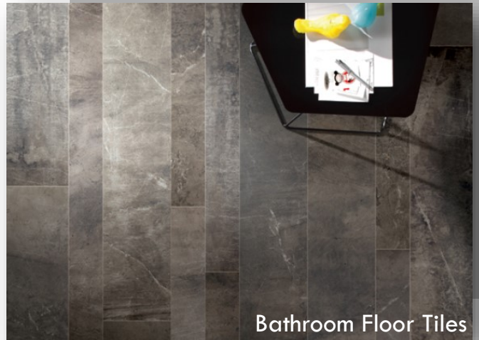
Bathroom Floor Tiles

All finishes are subject to change without notice based upon price, availability, etc.