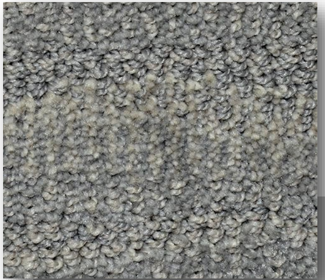
Carpet in Bedrooms