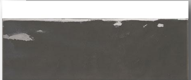
Kitchen Backsplash Tile