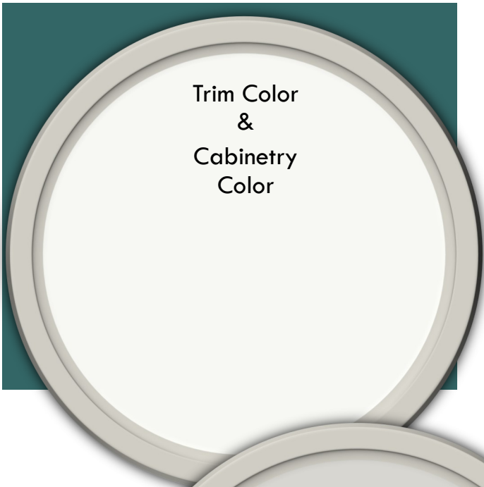
Trim Color & Cabinetry Color