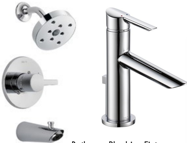
Bathroom Plumbing Fixtures