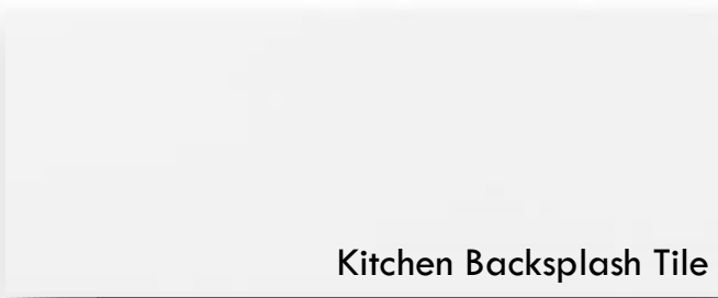
Kitchen Backsplash Tile