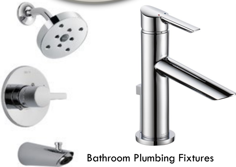
Bathroom Plumbing Fixtures