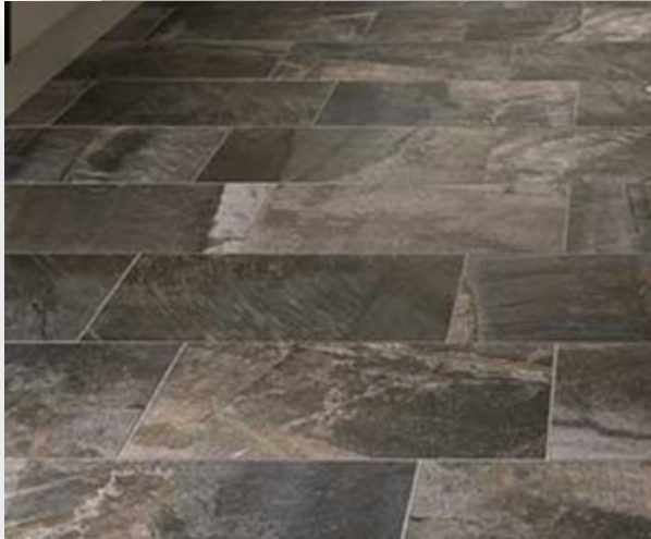
Bathroom Floor Tile