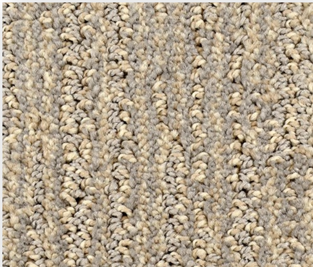
Carpet in Bedrooms