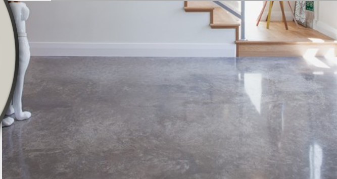
Polished Concrete Flooring Downstairs